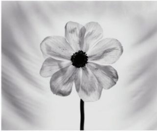
Lynn Stern, Unveilings #59 1985, Gelatin Silver Print 8 by 10 inches edition of 6 plus 2 artist proofs.