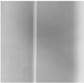
Interior Light White Shadows #2 1979, Gelatin Silver Print 11 by 14 inches Edition of 7. Plus 1 AP.