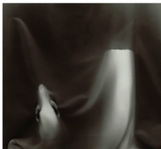
Animus #5a Split Toned Negative, Gelatin Silver Print 20 by 24 inches Edition of 7 variants.