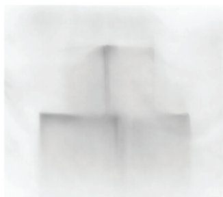
Lynn Stern Force Field #21-121a 2021 Archival Inkjet Pigment Print 34 by 38 inches edition of 6 plus 2 artist proofs.